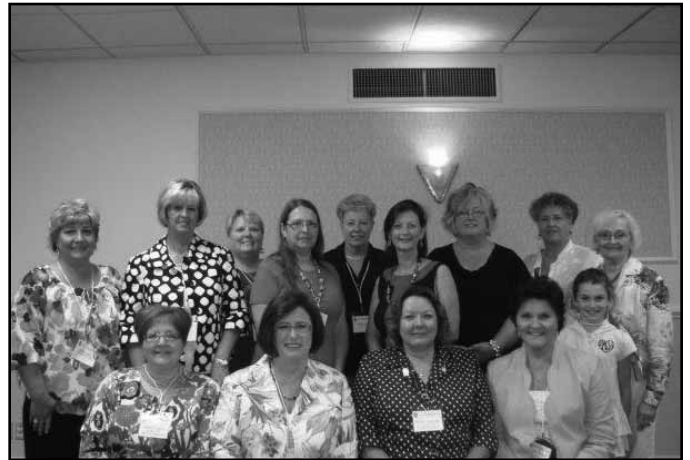
Auxiliary meeting attendees at the SMA in Cincinnati, Ohio.